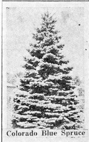
Colorado Blue Spruce

Several years ago this tree was used only as an ornamental. However, its extreme hardiness, rapid rate of growth and broad, dense branches extending to the ground are ideal characteristics of a shelter belt tree. As the use of the Blue Spruce became more general the cost of young trees has been reduced each season and prices now are such that every grove can be fortified with a row of these beautiful, drouth resistant trees. Usually there are about 10 good blue specimen trees to every 100. We do not make a practice of "holding out" these select specimens, thus enabling you to select a few very beautiful specimens for planting about the house or lawn. Be sure to plant at least a few Colorado Blue Spruce this year, they more than double in value each season and are the easiest evergreen to grow.